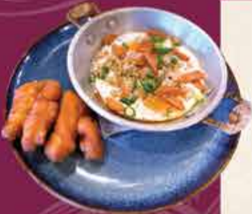
THAI PAN EGGS

TUE : 9.00 am - 2.30 pm, WED - SAT : 7.30 am - 2.30 pm, SUN : 8.30 am - 2.30 pm