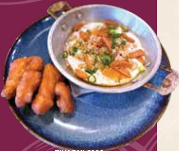
THAI PAN EGGS

TUE : 9.00 am - 2.30 pm, WED - SAT : 7.30 am - 2.30 pm, SUN : 7.30 am - 2.00 pm